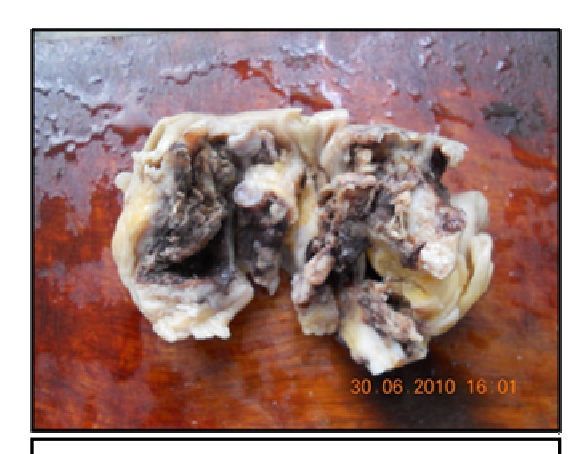
Figure-2: Gross photograph showing greywhite nodular mesenteric mass, partly cystic and solid