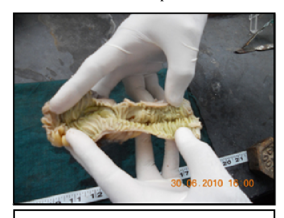
Figure-1: Gross photograph showing ileal loop with ulcerative lesion

Malignant histiocytoma. On laparotomy, an ulcerative growth was seen arising from small bowel nearly about 30 cm from ileo-cecal junction not infiltrating the surrounding structures and a separate partially cystic and partially solid mass arising from the mesentry. No suspicious lymphadenopathy or metastases were seen in the liver and peritoneum.